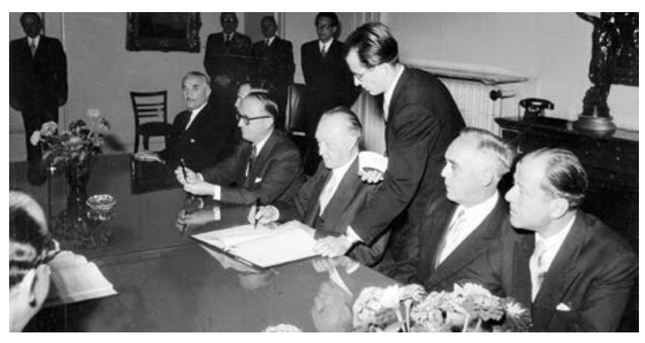
German Chancellor Konrad Adenauer signing the Luxembourg Agreements on September 10, 1952

Since its founding in 1951, Claims Conference has secured recognition, compensation and restitution for survivors of the Holocaust. Historic agreements were signed in 1952, in Luxembourg, between the governments of Israel and Germany, and the Claims Conference, and in the decades that followed, Germany has paid more than $90 billion in indemnification to individuals for suffering and losses resulting from Nazi persecution. Over the years, ongoing Claims Conference negotiations with Germany have resulted in the creation of compensation programs which provide direct payments to survivors who were persecuted as Jews in Germany, Austria and other countries that were occupied by the Nazis or their Axis allies. Moreover, German funds negotiated by the Claims Conference support a wide range of vital and life-sustaining care for survivors in need around the world, including home health care, medicine, hot meals and friendly support networks. Perhaps most