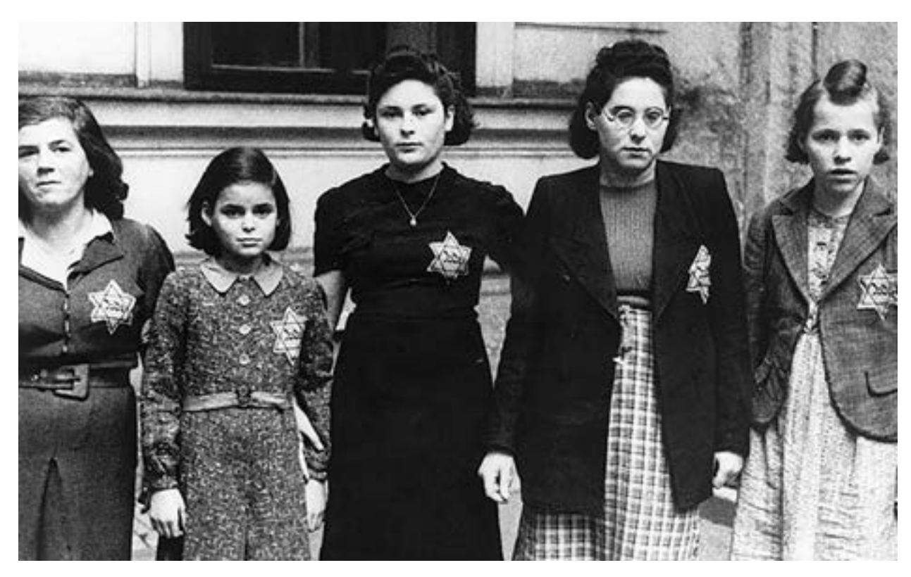
Women and children wearing the yellow star marking them as Jews, Vienna, Austria, 1941.

In cases where Nazi victim status is unclear, agencies should consult the Claims Conference which will refer the matter to an in-house expert for clarification.