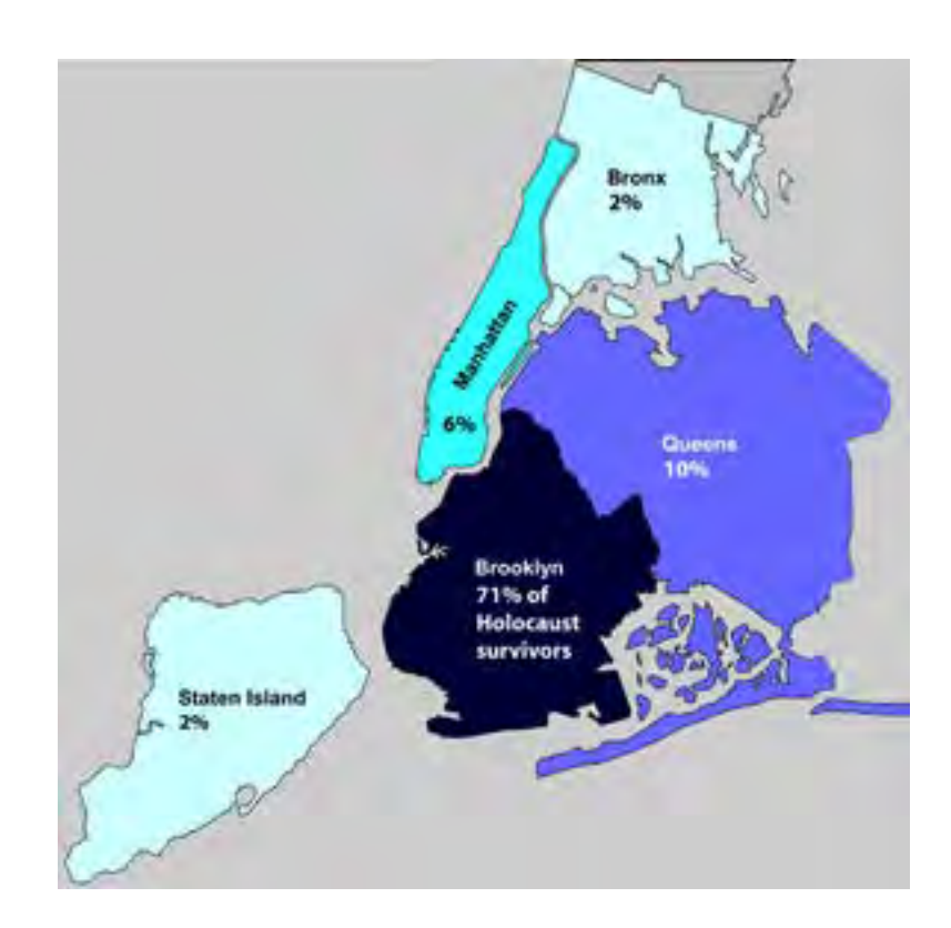
Figure 2. Where Holocaust Survivors Live in New York City

Ninety-one percent of the Holocaust survivors living in New York State live in New York City.